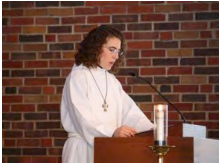
The Lector and Litanist help lead the congregation during services with readings from the Bible and with prayers.

Many of the musicians would prefer to be invisible because while they love to sing they don't want to be seen doing it. They meet secretly in an undisclosed location (the choir loft) each Wednesday night at 7p.m. – easily the worst kept secret at St. Timothy's. They meet to practice new and inventive ways to sing a lot of notes all at once and to hold their breath for impossibly long periods of time.