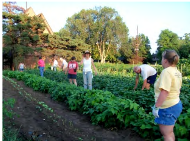
Rabbit Wranglers Prepare for the Big Bunny